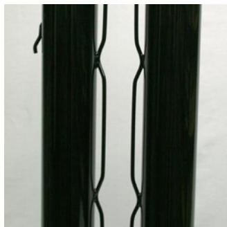
Integrated welded lacing rods