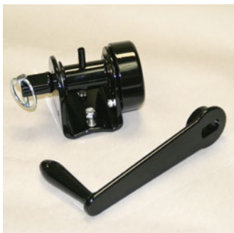
Aluminum Deluxe Reel