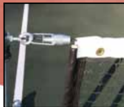
Rope Cable Adjustment