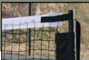
Velcro Net Adjustment