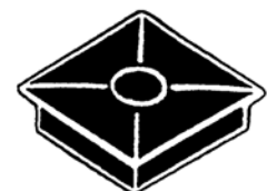
BBP-6 GROUND ANCHOR PLUG (RUBBER) FOR GREATER VISIBILITY AND DURABILITY